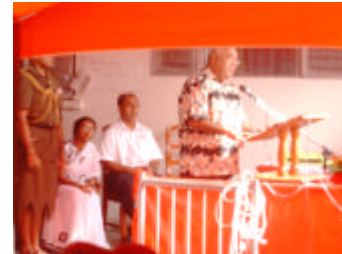
Ratu Joni speaks at the FRIEND Open Day in celebration of our 3 rd birthday on August 29, 2005.

On the occasion of FRIEND's 3 rd birthday, Ratu Joni Madraiwiwi, Vice President of Fiji, spoke in praise of FRIEND's work on behalf of poor and marginalized communities. The partnerships that FRIEND has built with the business community have had a direct bearing on the numbers of communities, families and individuals that FRIEND has touched with its work. Ratu Joni also emphasized the responsibility individuals have to participate in improving the circumstances of the underserved. The Vice President recognized that FRIEND has done well to face the many obstacles it has encountered in its short history and survive. He said, "FRIEND has made a great start and it has overcome great odds to be still here." He closed by wishing FRIEND "a very happy birthday."