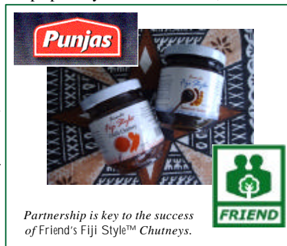
Partnership is key to the success of Friend's Fiji Style™ Chutneys.