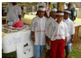
Left: Children get in the spirit of White Band Day. Right: Honored guests visiting FRIEND's booth in Shirley Park.

The White Band Action, a key component of the Global Call to Action Against Poverty, was launched in Fiji at the FRIEND offices as part of our recent 3 rd Birthday celebration. On Saturday, 10 September, Fiji took part in White Band Day II. On this day, around the world, people wore white bands to raise awareness and show their support for the global effort to end poverty. In Fiji, FRIEND promoted White Band Day in Shirley Park in Lautoka. We distributed free White Bands to the public and also encouraged people to speak to their communities and leaders about poverty alleviation to find out what's being done about it in Fiji. It's all of our responsibility to take part in the fight against poverty, and on White Band Day, the public answered the call to action.