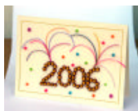
The New Year card designed by deaf youths

There are eight deaf youths who make handcrafted cards as part of the Income Generation Program (IGP) at FRIEND. They spend their days working on the cards to earn a living. Some in the group use the quilting technique to make cards with intricate floral and holiday patterns. Others work with traditional Fijian materials, like masi and seashells. All of the youths use their creativity to come up with the designs. They are able to express themselves--what they think of the world or what they want in life-- through the artwork on the cards. In addition to gift and holiday cards, they also do invitations and cards to order for special occasions. Outside of their work, the youths are involved in activities such as teaching sign language class on Saturdays that are free to the public, and they have formed a Western Association of the Deaf to look after their needs as a community.